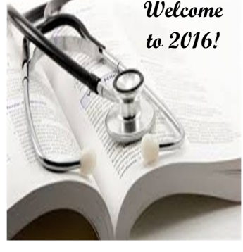
Volume 4, Number 1 Ianuary

We've all heard the word 'service' a lot in recent years. We know that ours has become a service economy, and that a majority of us have become service workers. We know that excellent customer service is critical to the long term success and survival of our organizations, and with it our own job security and opportunities for enhancement and advancement. And while it is an ancient concept, the idea of servant leadership—that those who would lead must first be committed to be servants for those who follow them—is an idea that has gained considerable currency in recent years. Service becomes a value, and not a series of activities, when it is engrained as an underlying philosophy which informs attitudes and guides actions.